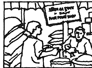
Macro marketing effort

You should further note that marketing effort both on the part of the firm as well as the state i.e. both at the macro and micro levels is relevant to growth. When the involvement of Government in the marketing and distribution of ideas, essential goods and services is significant it is called macro marketing. As against this where a firm enjoys sufficient freedom to design its marketing effort, it is considered to be a case of micro marketing.